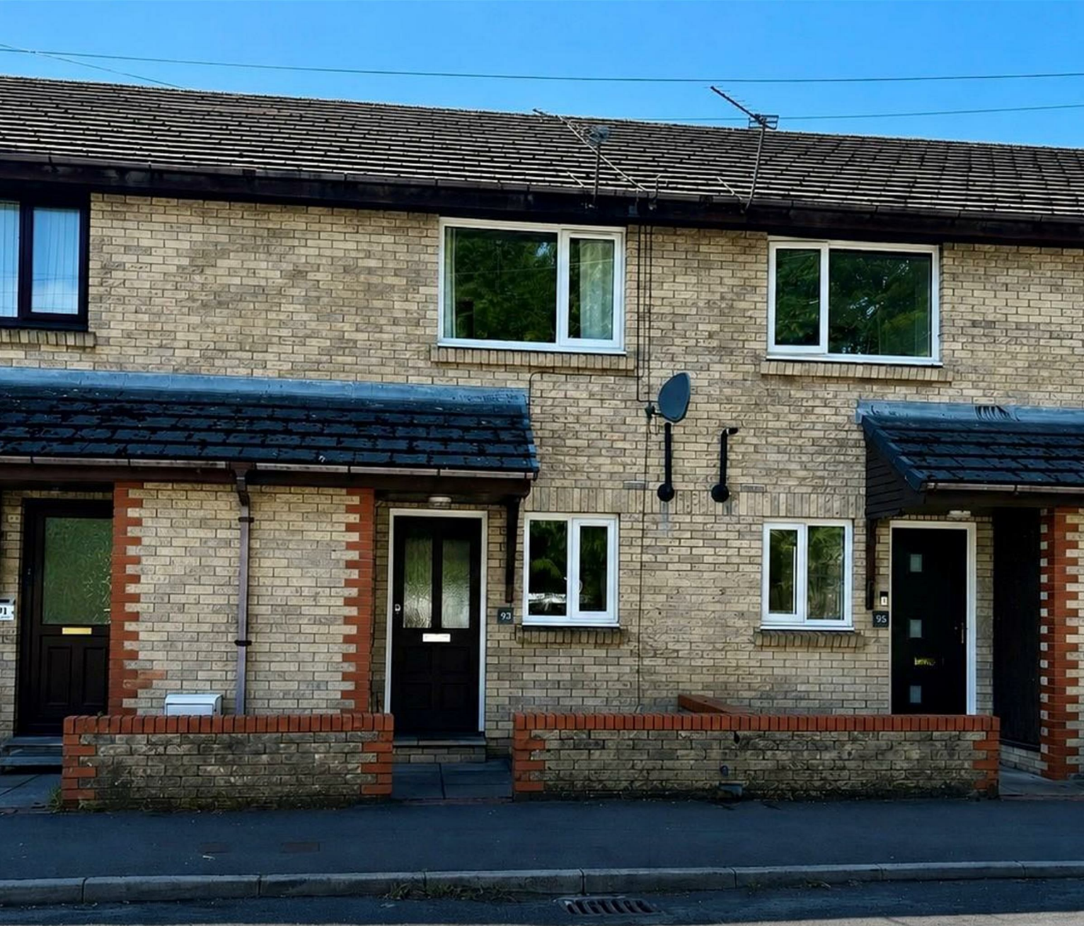
93, Cemetery Road Bridgend, CF31 1NA